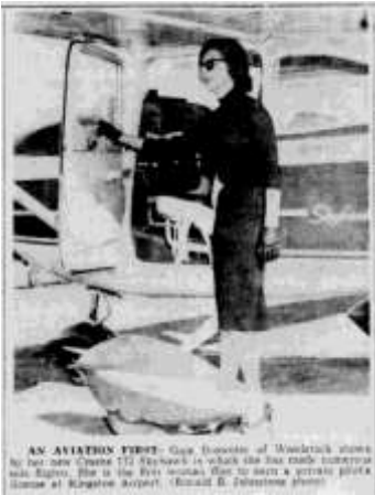
Article from the Kingston Daily Freeman, May 8, 1964